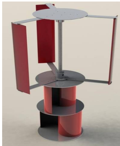
Fig-3: Combined Rotor[5]

COMBINED ROTOR: Combined rotors are the combination of two different rotor (Savonius and H-Darrieus) mounted on the same shaft. Mostly combined wind or water rotors are available in the vertical axis configuration. Combined rotors generally combine Darrieus and Savonius type wind rotors. However, many other configurations might be available for designing of combined rotors. A combined rotor overcomes the shortcomings of the one fold airfoil turbine rotors and takes advantage of another turbine rotor. Since the Darrieus rotor is not self-starting, a blended design with Savonius blade can make the combined which can make it self-starting and more power efficient and high torque co-efficient than any of the single rotor [11].